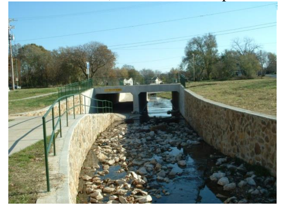
Upper Jordan Creek Greenway City of Springfield

Stormwater Mitigation Category: This category provides funding to address storm water management, control, and water pollution prevention or abatement related to highway construction or due to highway runoff, including activities for runoff pollution studies, soil erosion controls, detention and sediment basins, and river clean-ups.